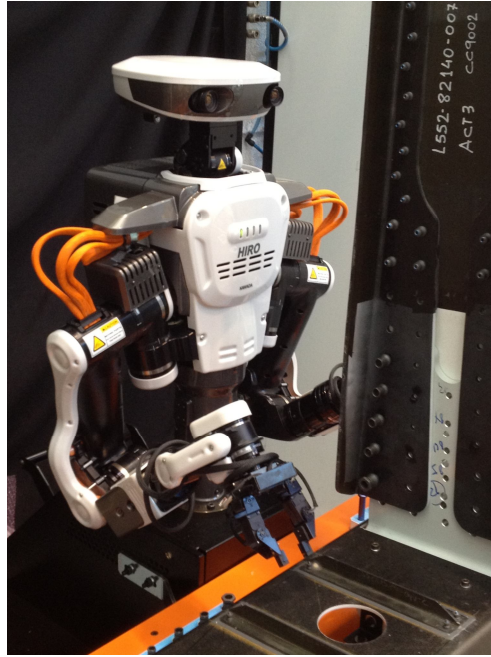
4. figure. Dual Arm Concept, NextAge in an aeronautics assembly operation

Robot surface is smooth and curved, added with soft patching at critical areas to avoid hazardous pinch points for humans while interacting in the same workplace. The big benefit of is the interaction, where robot physically can hand over, in a safe and controlled manner work pieces or tools to humans. It is in fact the next revolution in robotics, where two distinct worlds come together. Summarized benefits of sensor controlled light weight dual arm robots over traditional 6 axes machines are: