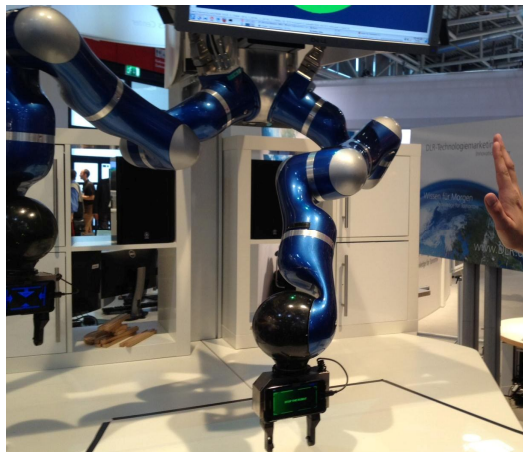
5. figure. New Man/Robot workplace interface

Face and gesture recognition simultaneously will help in future to develop person specific and secure human-robot interface. By having the modern workplace equipped with gesture, pose and intent monitoring vision systems, (similar like to be found on a simple Xbox PlayStation) working with visible light a new dimension is added. These cognitive vision systems can mark i.e. on the floor a safeguarded area making it clear for operators what is safe and what isn't. Any intrusion in unsafe areas will result in a system halt due to its interrupted projection beams. In addition robot status or other production information can be projected in any part of the workspace to provide further information to the user. Figure 5 demonstrates the use of a hand gesture to stop a light weight robot movement based on input by a 3d cognitive vision system.