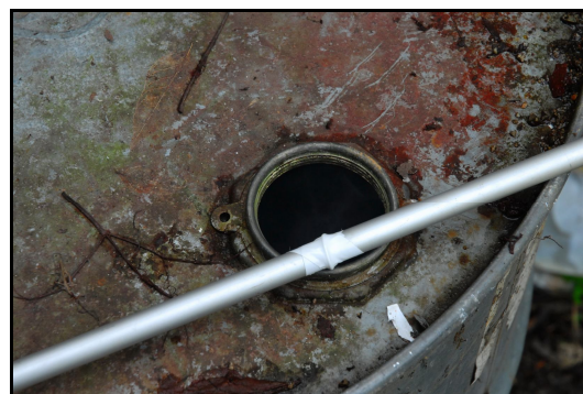
3. figure. Measuring