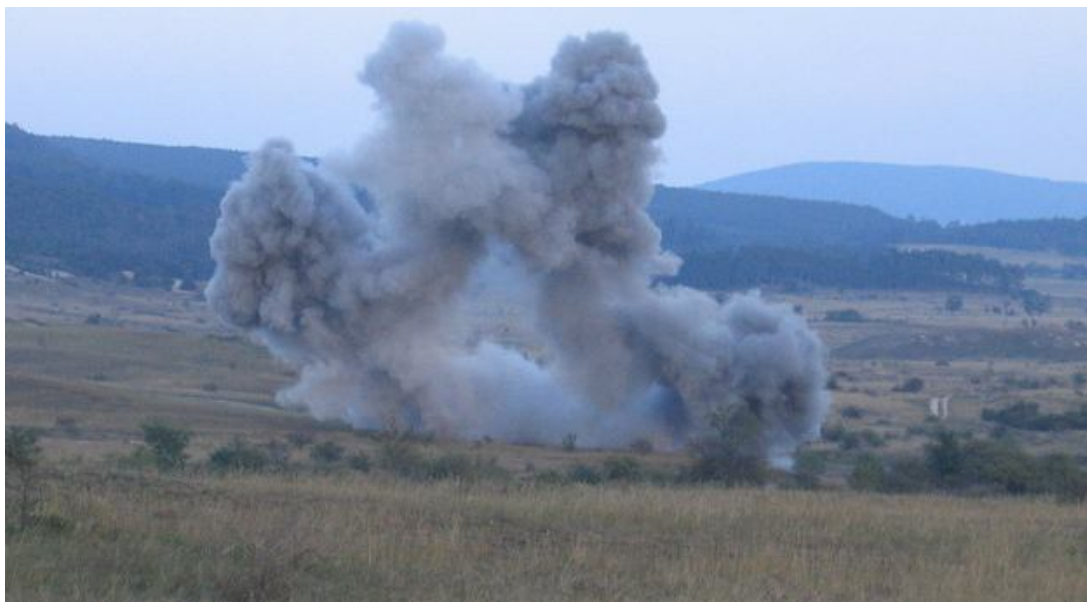
1. figure. Attention! Explosion!

Explosions may occur in mining, demolition of buildings, military operations and even in caving. Vast volume of gas is produced in explosions which expands in milliseconds and therefore induces shock waves resulting work. This gas contains poisonous and less poisonous compounds. We have to examine and analyse this gas, because during operations the employees approach and check the location of the explosion and do labour there, hence safety regulations should be introduced to avoid intoxications and protect their health.