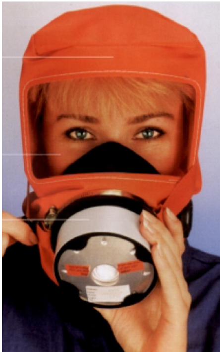
1. figure. Smoke hood [10]