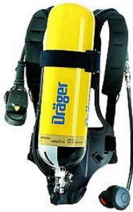
2. figure. Isolated respirator [10]

Safety distance should be respected from the view of safety technology and hygiene. It is advisable to consider relief and wind.