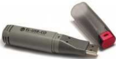
2. figure. LASCAR EL USB CO datalogger

Method: blasting was conducted in a barrel with capacity of 0,2 cubic metre. LASCAR Electronics EL USB-CO datalogger was used for the measures. This instrument operates with accuracy of 1 ppm and logging rate of 10 seconds. The data can be downloaded on PC and can then be graphed.