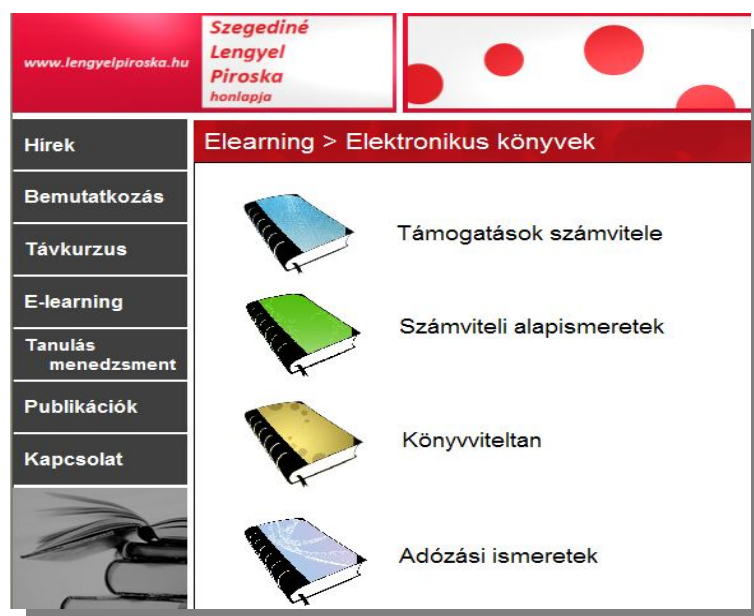
Figure 1. Electronic books compiled by the author http://www.lengyelpiroska.hu/elkonyv.html

The e-books have been available since October, 2009 and mainly used by high school student teams, as an additional learning source to the traditional ones and, despite the relatively short time elapsed, can show a considerable success achieved. The number of visitors of the homepage has exceeded 16,000, in the first eleven months.