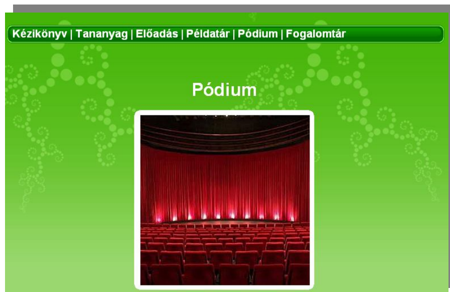
Figure 6. The Stage

The Stage – according to my expectations – gives the experience of joyful learning, it raises the lower status students’ interest, too and increases their autonomy sensation. Its atmosphere, being characterized by cooperation, enhances the inner motivation, the long lasting maintenance of which may only be fruitful in such a learning environment, where the single elements, the “players” are strengthening and presupposing each other.