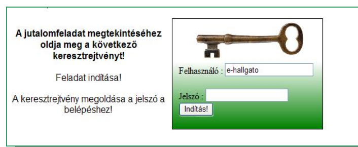
Figure 5. The launch of a reward task

When developing the Practices module, the guiding idea of the process was that the acknowledgement of the results releases the student's inner insecurity, the success motivates him positively and he needs an intense motivation to achieve the success. The works, the tests have to possess such contents that the students can look forward to go through this "account giving" phase of the learning process, as a source of joy and, as a result, they will be more motivated regarding their self-development and study results. This goal is being served even by reward works, which is a further acknowledgement of the results achieved and at which the students can arrive through the solution of a simple task (affirmation of the acknowledgement).