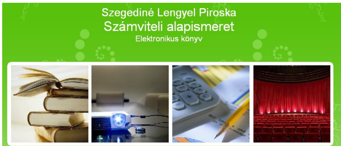
Figure 2. The four modules of the e-book: Introduction to the Accountancy (Learning material, Lectures, Practices, Stage)

In the course of planning the single modules and the learning environment, I put major emphasis on the clear-cut structuring in order to provide an easy “look-through”, a “sense of safety” for the students, as they will be able to select the devices, modes for acquiring and practicing a given lesson, a homework. In a well-structured learning material the chance for the self-relied progress is better, the derivation of consecutive new items is simpler, the manageability of the material is better. [3]