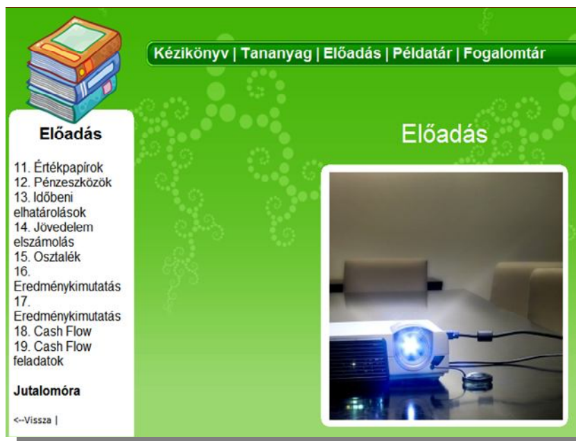
Figure 3. The Lecture

The “Lectures” module is the second level of the learning process, the level of deepening the knowledge, learning with interaction and learning with teacher’s cooperation. The lectures are