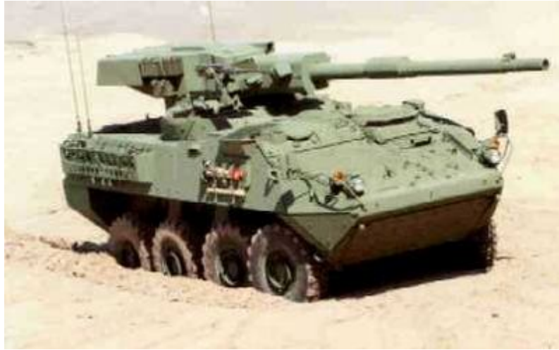
Fig. 2. Stryker MGS

(Source: http://www.haborumuveszete.hu/rovatok/fegyverek/pancelosok/stryker_pszh/ ) (28. 10. 2010)