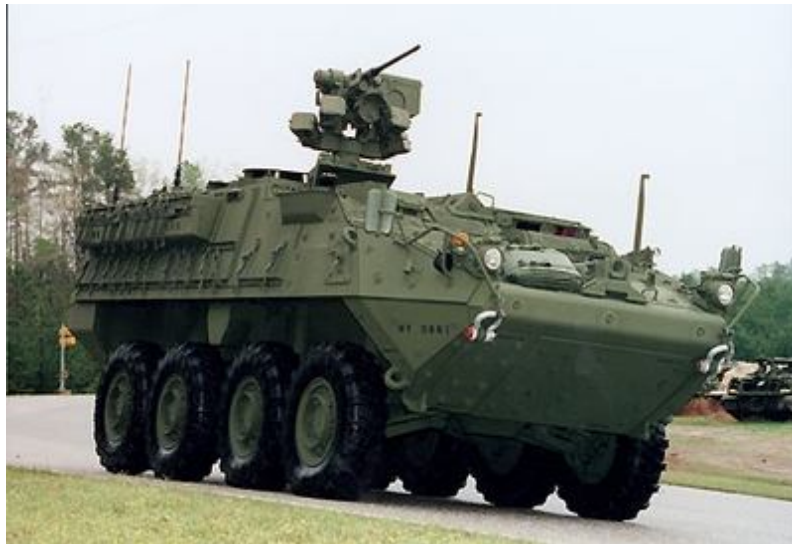
Fig.1. Stryker ICV

The crew of Stryker ICV is made up of 11 people (commander, driver and 9 crewmen). Its armament consists in the Protector Remote Weapon System. Contents: 1 pc M2 machine gun, 1 pc MK19 40 mm grenade launcher, or 1 pc MK240 7,62 mm machine gun and 4 pc M6 smoke grenade launchers.