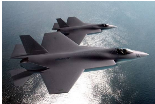
Fig. 3. F-35 fighter jets (28. 10. 2010)

The F-16, the new F-22, and moreover, the newest F-35 fighter jets are able to fly at sea level, reaching twice the speed of sound, with a speed of more than 2000 kms per hour.