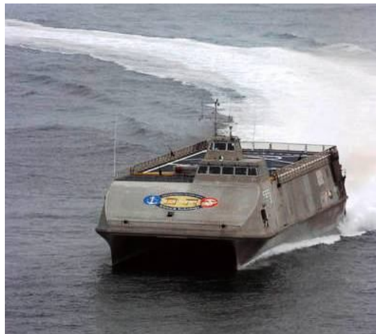
Fig. 5. The FSF1 SeaFighter

enemy coast from afar. Nowadays however, there is a need for faster and more expandable ships. Some of these do not even look like ships as we knew them. The FSF1 SeaFighter 3 is a vehicle which was developed by the Naval Research Office.