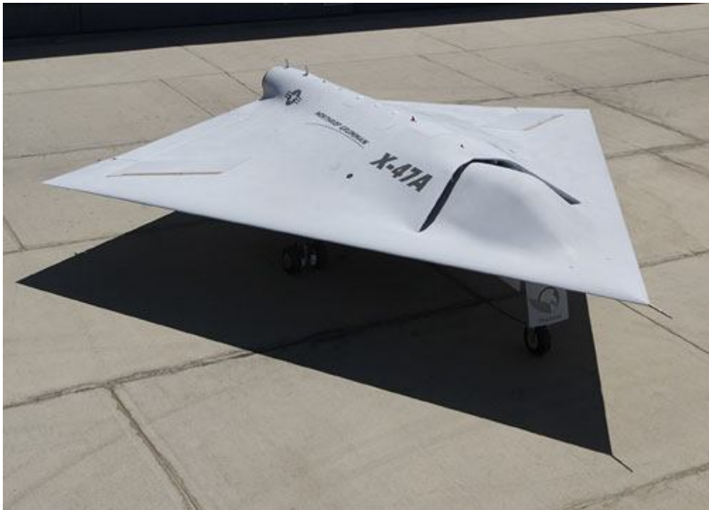
Fig. 4. The X-47A UACV

(Source: http://www.jp-petit.org/Disclosure/disclosure_a_doubt.htm ) (28. 10. 2010)