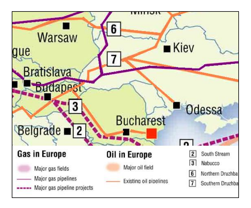
Map 1. Oil and Gas in Europe

The location of gas and oil pipelines in Ukraine poses environmental risks as well. These pipelines (e.g. Brotherhood, Druzhba) that transport the oil or gas through the region into Europe have been operating for 20-30 years. Seven oil and gas pipelines pass through the Transcarpathian Oblast, and it has experienced environmental contamination. In 2003, the Druzhba oil pipeline spilled 110 tons of oil into the Latorca River at the Vereckei Pass [9].