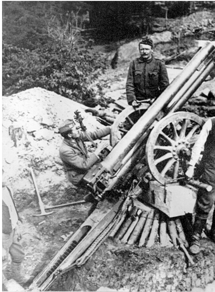
Picture 2. Camp artillery device in off-the-cuff air defense shooting position

We can say that by the end of the war the air vehicle repellent devices, especially the cannons got bigger role and more emphasis in the battles. But they didn't get independent from the camp and fortress artillery in the Austro-Hungarian Monarchy. On the other hand the construction and mass production of really effective and primarily air defense cannons never happened. During the collapse the majority of the Monarchy's cannons used in air defense either got destroyed or got taken away by the enemy. So the Hungarian Republic of Council too owned only ten cannons suitable for air defense. Four of them were 14M, six were 5M. They were going to protect the capital and the 43. artillery regiment with its five air defense batteries was also set up. 6