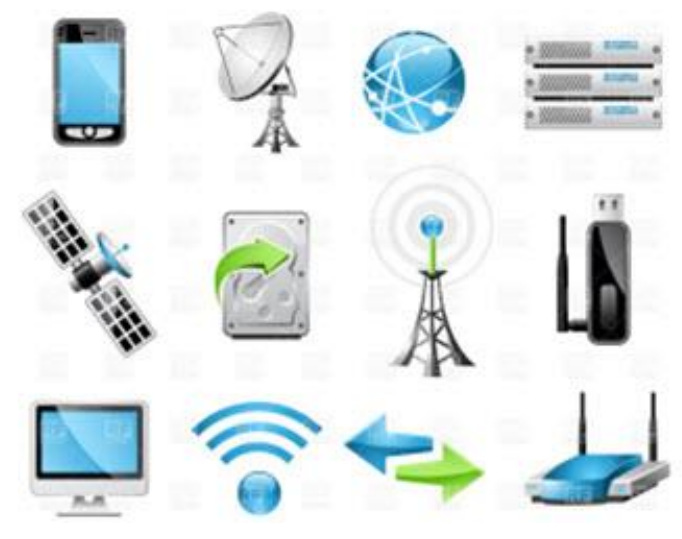
Figure 2. Types of Wireless Communciation [8]

If we are talking about radio technologies, we can make differences between the different types based on their effective range. We can start the listing with the well-known Wi-Fi or Bluetooth connections, and via different less known (e.g. HiperLan<sup>3</sup>) or well-known solutions (e.g. WiMAX<sup>4</sup>, Zigbee<sup>5</sup>, etc) with higher and higher effective range, reaching the GSM solutions or satellite systems.