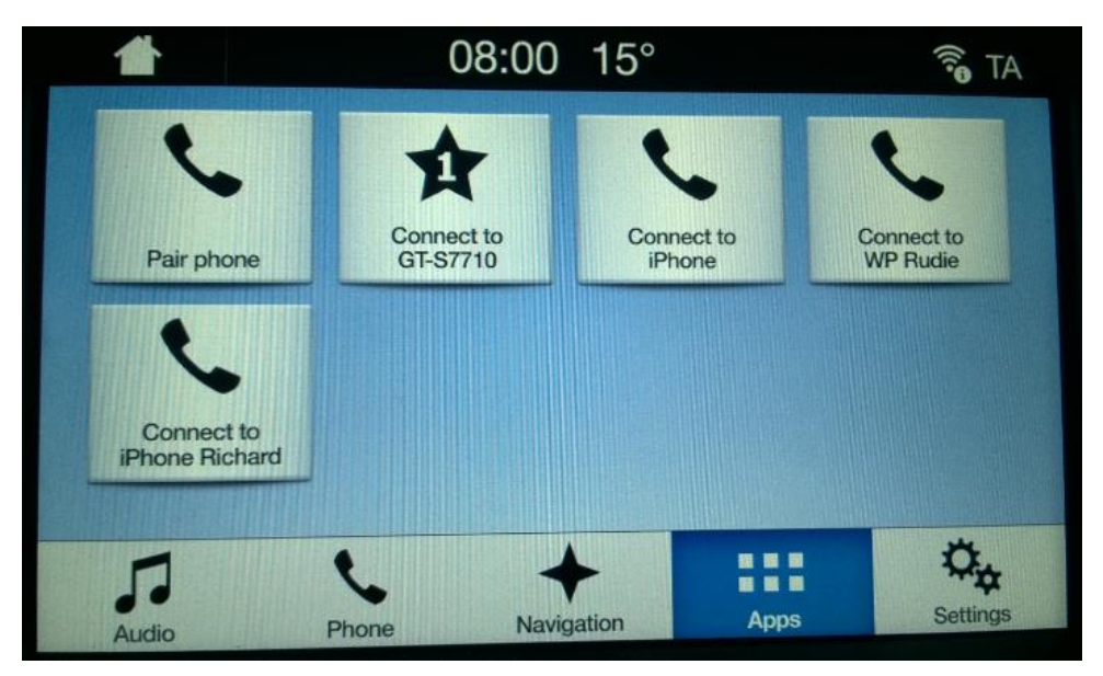
Figure 3. Pairing of phone and car computer using Bluetooth connection<sup>11</sup>

For building WLAN networks, we can use the Bluetooth capability as well, but generally this connection is used between 2 assets directly. It is because of the short effective range of this solution, which is typically some 10 meters. For example, this type of connection is used to pair a car computer with our smartphone.