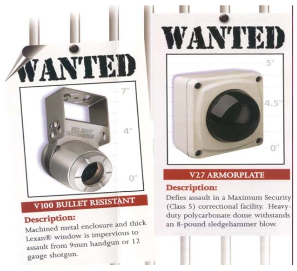
Figure 1 CCTV devices used in US correctional facilities [9]

Additionally, prisons have been actively using Closed Circuit Television (CCTV) technology to make it possible for locations in prison to be remotely viewed. Given that prisons are violent places and a wide range of negative behavior occurs in this environment, it is possible that the prevention of prison disorder is a purpose of CCTV. [8] This behavior is usually engaged in by prisoners and results in physical negative impact (prisoner-on-prisoner assault, prisoner-on-officer assault, sexual aggression, and murder), psychological negative impact (verbal abuse and threats), or economic risks (theft, extortion, and robbery). [8] Other purposes of CCTV surveillance in prisons include the detection of crime and disorder, improving the internal control or acting as a general monitoring tool (Figure 1). [8]