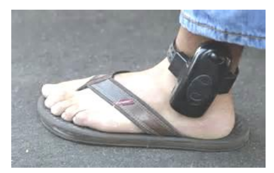
Figure 3 Monitoring ankle bracelet [11]

The main area of prison institution there ICT made a vivid footprint is educational programs for inmates. By participating in the programs, the inmates would access to digital literacy ( E-learning ). The programs could support prisoners' rehabilitative potential and increases the chances of having more family contacts. [12] ICT programs will increase and equip the inmate's knowledge and opportunities in empowering them. [12]