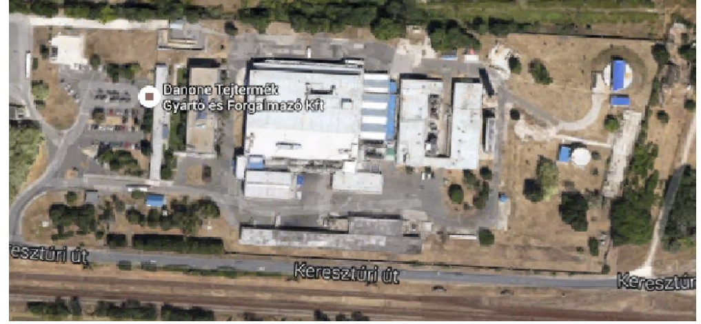
Fig2. Map for the sample project.

Some cases the factory has a basement, which is full with machinery, like air handlers, motors and drivers. They might make additional RF noise. Also if the plant has many buildings the other weak point is the distance. The draft version of the investigation (forecast data only) does not require site attendance. The week points can be estimated by checking the factory layout only. On Fig.2. as a sample project there is map about the biggest yoghurt manufacturers site located at Budapest. The author never been to this site, only Google map was used to provide data to fill the Estimation Sheet. The resolution of the map is limited, but still usable and free of charge. Using AutoCAD we are able to draw draft plan about the layout, which can be seen of Fig.3. The drawing is a simplified map, showing only the required depth of the site for designing.